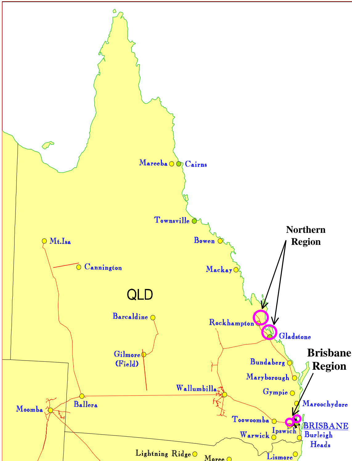
Map showing Regions of the Network