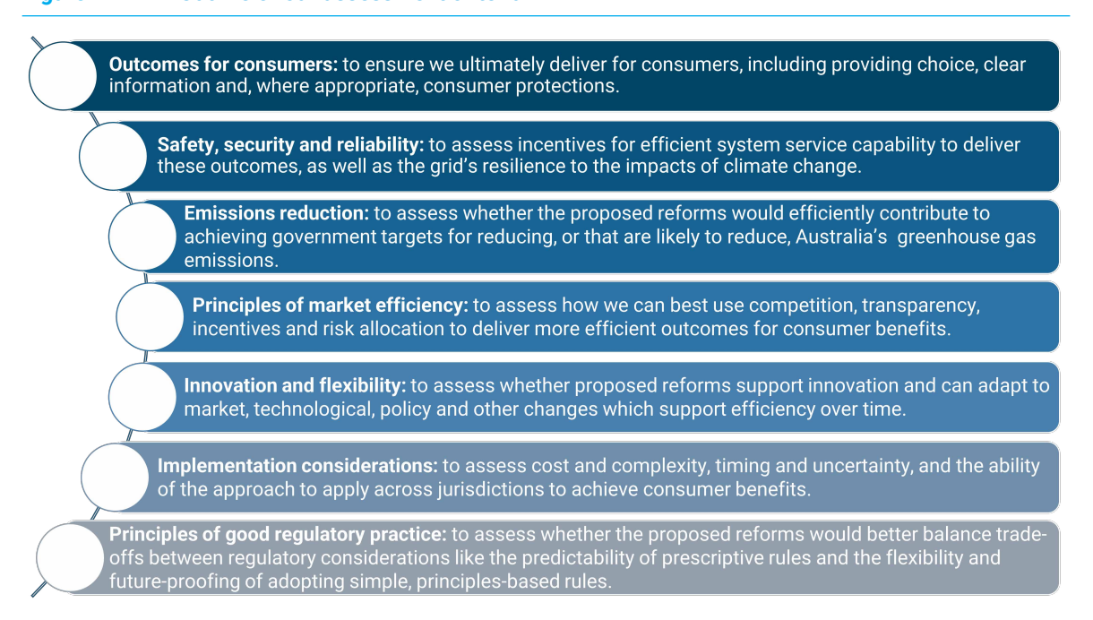
Figure 2.1: Outline of our assessment criteria

We develop assessment criteria from this list for all of our reviews and rule changes to ensure you have a clear and consistent framework to engage with our decisions. These criteria have also fed into our in-house <u>initiative</u> to improve the accessibility and effectiveness of the AEMC's communications through more concise and accessible documents. You will see the relevant criteria reflected in each of our documents.