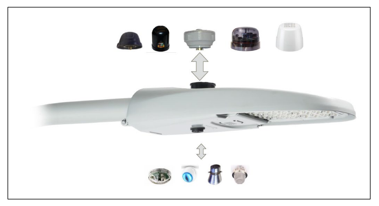
FIGURE 3: ILLUSTRATON OF LUMINAIRE WITH SMART CONTROLS ON TOP AND SENSORS BELOW

In the continuing transition of street lights to being digital devices, a further energy-related element to consider is the progressive merging of smart city sensors with street lights. As per the figure below, some street lights meeting <u>Zhaga Book 18</u> requirements are able to accommodate a variety of low-cost smart city sensors (e.g., to count traffic, count people, measure climatic parameters, measure noise levels). The energy consumption of such sensors, while generally only 1-3W, is variable. Such luminaires are already being deployed in Australia by both DNSPs and councils.